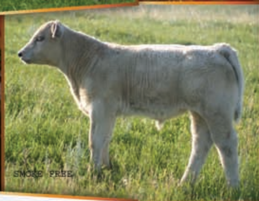
Alias X Hardcore Charolais Cow